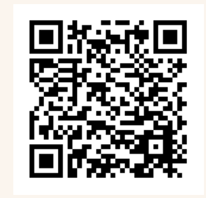
CFA Society Hong Kong Candidate Services

2. In the long run, share of profits in the economy (S_t^k) and P/E multiples (PE_t) can not continually \uparrow or \psi , trend growth rate (GDP_t) implies growth rate of the total value of equity in the economy (V_t^e) .